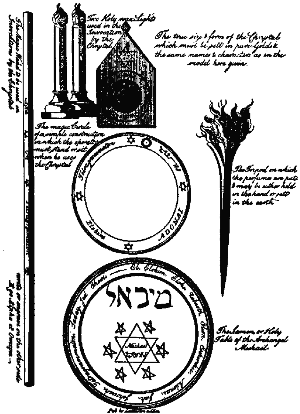
The Magic Instruments of Art Figure I