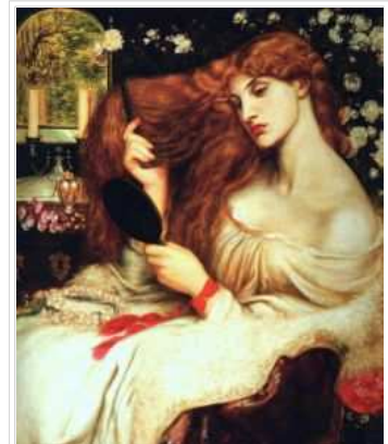
Lady Lilith by Dante Gabriel Rossetti