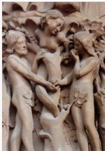
Adam, Lilith, and Eve, c. 1210 AD, Base of trumeau, left portal, West Façade, Notre Dame, Paris.