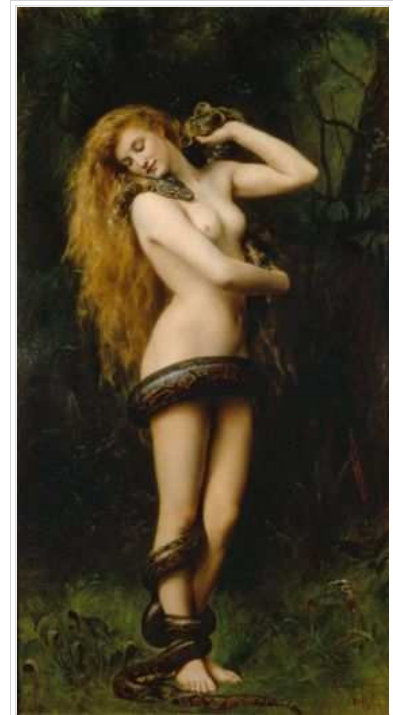
Lilith (1892), by John Collier