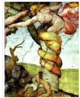
"Lilith" from Michelangelo's "The Temptation of Adam and Eve". A common iconographic depiction of the serpent of Eden in late Medieval and Renaissance art.

Of Adam's first wife, Lilith, it is told (The witch he loved before the gift of Eve,) That, ere the snake's, her sweet tongue could deceive, And her enchanted hair was the first gold. And still she sits, young while the earth is old, And, subtly of herself contemplative, Draws men to watch the bright web she can weave, Till heart and body and life are in its hold.