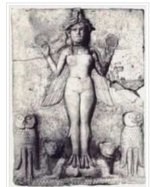
The Burney Relief, "Queen of the Night", ca. 1950 BC.

The Gilgamesh passage quoted above has in turn been applied by some to the Burney relief , which dates to roughly 1950 BC and is a sculpture of a woman with bird talons and flanked by owls. The relief is Babylonian, not Sumerian or Assyrian, as sometimes described. While the relief may depict the demon Kisikil-lilla-ke or Lilitu of the Gilgamesh passage, it might be a goddess. The piece is dated roughly about the same time as the Gilgamesh fragment featuring Lilith, this, in turn was used translate it as Lilith/Lillake, along with other characteristics of the female being in the Gilgamesh passage. The key identification is with the bird feet and owls. She is wearing a multiple-horned mitre and has wings, both indications of high divinity. The objects in both her hands are symbols of divine authority. However, the relief is also thought to be of the Sumerian goddess Inanna or her underworld sister Ereshkigal and some scholars currently regard the connection with this relief and Lilitu/Lillake as dubious. [20] The relief was purchased by the British Museum in London for its 250th anniversary celebrations. Since then it was renamed "Queen of the Night" and has toured museums around Britain. Modern pagans have been allowed by the museum to organize religious ceremonies around the relief. A similar relief dating to roughly the same period is preserved in the Louvre ( AO 6501 ).